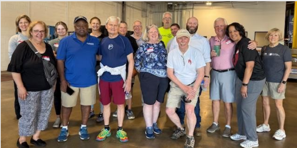
We ran into District Governor Kevin Kendrick at Nourish Up this morning and couldn't pass up the chance for a quick photo together!